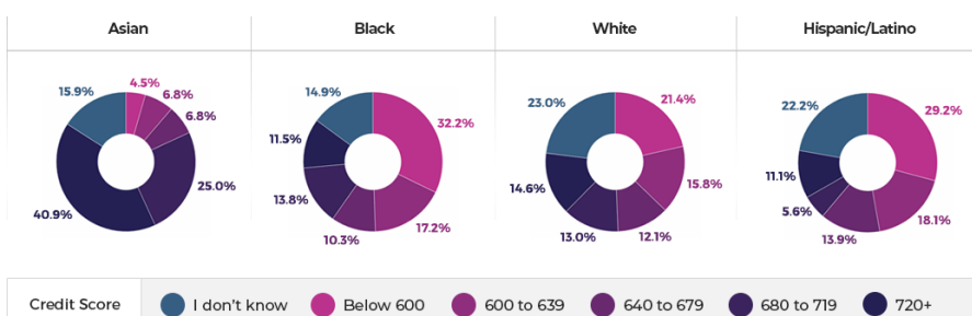
Figure 1 Black and Hispanic Americans on average reported disproportionately lower credit scores than White and Asian Americans (4)

Decades of redlining , blockbusting , and white flight have led to minorities feeling disproportionate effects in terms of quality of life. This includes being forced to pay excessive housing costs, being forced into low-paying jobs, and having to enter school systems with low educational attainment. The disproportionate costs felt by minorities lead to more financial struggle when trying to operate a business (See Figure 3).