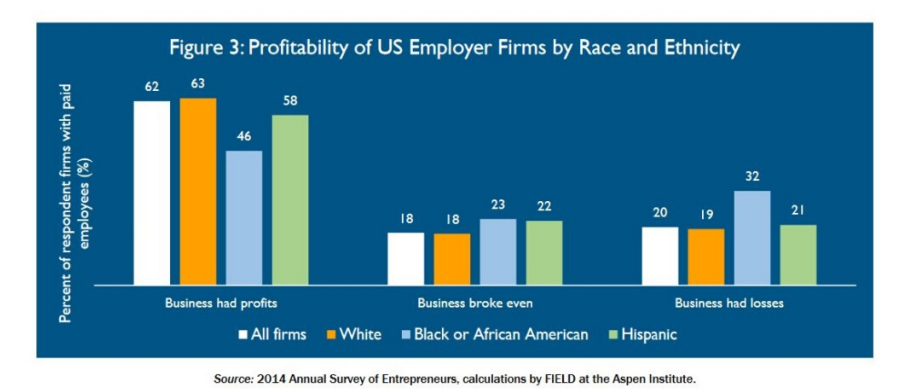
Figure 3: Black- and Hispanic-run businesses tend to financially struggle more than the average American business (6)