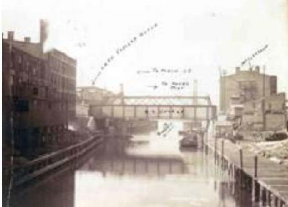
The Canal Harbor