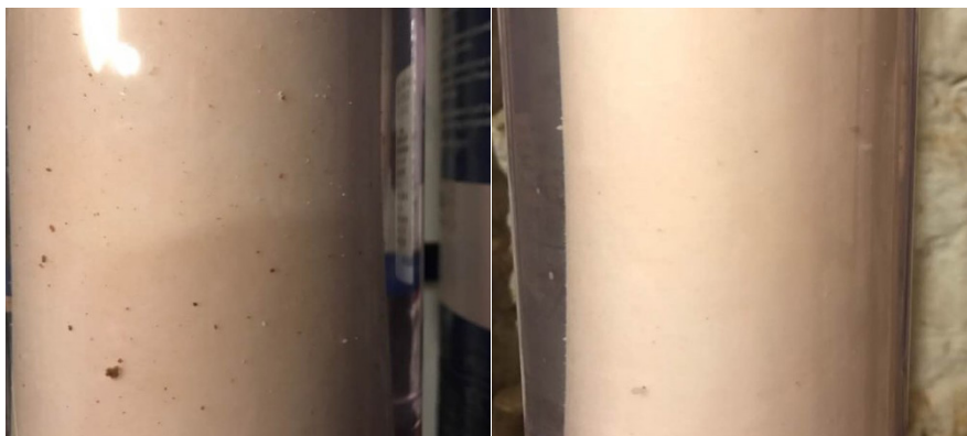
Figure 11: Comparison of two pre-filters installed at the same time. One filters water in the carriage house apartment, and one filters water to the house. Note the scale on the one to the left. This demonstrates that the contamination of water happens randomly. Annual testing of only a few homes may miss events like this.