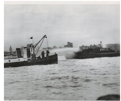
Figure 2: October 30, 1951 burning barge containing 3,500,000 gallons of leaded gasoline in the Buffalo River.

Thanks to the creation of agencies like the Environmental Protection Agency (EPA) in 1970, events like those are now less common and usually less severe. 16 However, our water supply has another big problem: we have a combined sewer system. That means the sanitary sewage that comes from our sink, tubs, and toilets ends up in the same pipes as our road's storm sewers on the