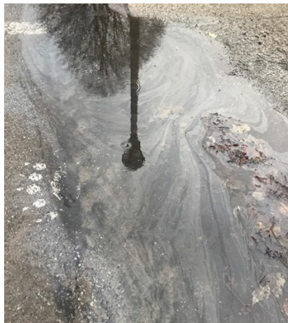
Figure 3: Note the oily sheen in the curbside puddle at the intersection of Humboldt Pkwy and Woodward Ave from the December 30, 2019 rainfall.