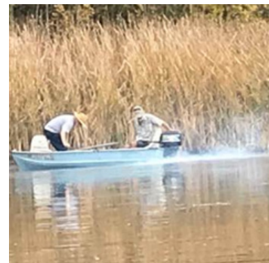
Figure 12: Motor boat spewing exhaust on Hemlock Lake in 2017; this is the water supply for Rochester, NY.

This may indicate that the CSOs contribute to Syracuse's rate of blood lead poisoning, which is 198% higher than Rochester's. That suggests the additional 74% increase in lead poisoning experienced in Buffalo could be attributed to the release of contaminated scale from its history of manufacturing and commerce. However, when you consider relative population sizes, an even larger proportion of causality would appear to fall in the CSO category. Other factors would need to be considered, including the locations of the CSOs, the location of the drinking water intake, and the relative sizes of the lakes. Regardless of the exact numbers, it is obvious that dealing with our CSOs is a paramount issue in treating the blood lead exposure crisis.