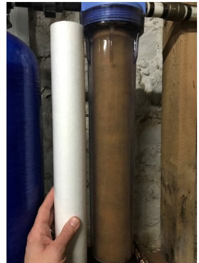
Figure 7: Discoloration in water filter following the January 24, 2020 water main break at Main St and Delevan Ave.

Of the four samples we analyzed, three exceeded NYSDOH Drinking Water Part 5 Maximum Contaminant Level of 0.015 mg/L. Each of these three samples was taken after our water service line