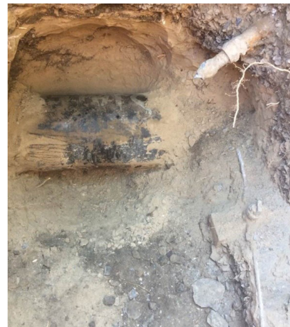
Figure 5: Circa 1890 Humboldt Parkway water main. Note the 3/4" copper service on the bottom right and the older 1/2" disconnected lead service at the top right.

line. When replacing the service line, however, we discovered the tap was \frac{3}{4} inch and copper. The copper line converted to the 1-inch galvanized pipe that entered our basement about 10 feet from the water main. It appears the city's records are not entirely accurate or complete.