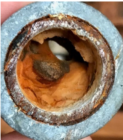
Figure 4: Note the scale in this section of pipe that was removed from our 1892 home in the Parkside neighborhood of North Buffalo when the water service line was replaced in July, 2016.