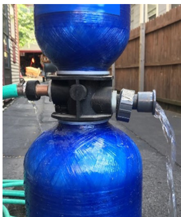
Figure 10: Whole house water filtration system with reduced water flow, possibly due to phosphate-based corrosion inhibitor.

Rather than rely on the phosphate-based corrosion inhibitor, a better solution is replacing water mains, beginning with the oldest. However, when cost is an issue, water mains can be cleaned and even relined.