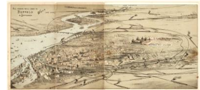
Figure 2: Bird's Eye View of Buffalo in 1901 showing the interplay of railroads, waterways, and manufacturing.

There were other grievous social consequences to the new car-based travel infrastructure. Many of those who could afford cars took advantage of the new expressways to enjoy newer houses and larger lawns in the rapidly expanding suburbs. In the second half of the twentieth century, the city's population would shrink from roughly 600,000 to only 260,000, while the suburban population would boom. This was also fostered by federal policy: for example, returning soldiers from WWII were given low interest loans for housing, but only for new builds. They were not allowed to purchase existing homes in the city. Sadly, federal redlining policies combined with restrictive deed covenants, zoning restrictions, racial steering, and other engines of segregation concentrated people of color in inner cities and whites in suburbs. The suburbs also offered lower taxes as they supported largely residential infrastructure, whereas cities also had to pay for the infrastructure required by large corporations, industry, and commuters who earn money in the city but spend it and pay taxes elsewhere. 2,3