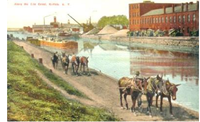
Figure 1: "Along the Erie Canal, Buffalo, N.Y." (No. M 71, Buffalo News Co., Buffalo, N.Y.)

At the same time, huge amounts of federal funds were pouring in to construct great roadways as the Eisenhower Interstate System was born. While much more polluting, less safe, and less efficient, freight by truck soon surpassed freight by train. This is thanks to the freedom that roads give, compared to rails, but also due to the fact that the roads were subsidized by tax dollars while the railroads were built and maintained by the railroads themselves. With that, Buffalo's advantage as a transportation mecca was all but gone.