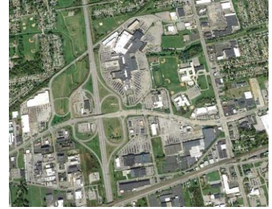
Figure 4: Expressways and large roads isolate pedestrians and cyclists, even from adjacent neighborhoods, from shopping districts like this along Walden Avenue and Interstate 90.

Mr. Lockwood presented numerous examples of places where urban expressways and major arterials were removed or put on road diets. Invariably what was lost in terms of LOS was gained by improved VMT. The landscapes that had suffered from the overbuilt infrastructure under the LOS model were restored to human scale,