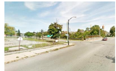
Figure 3: Vacant lot and crumbling infrastructure along the once prominent Humboldt Parkway, now Kensington Expressway, at Northampton Street.

As the city's wealth increasingly relocated to the suburbs, the tax base declined, infrastructure eroded, and poverty became increasingly concentrated.