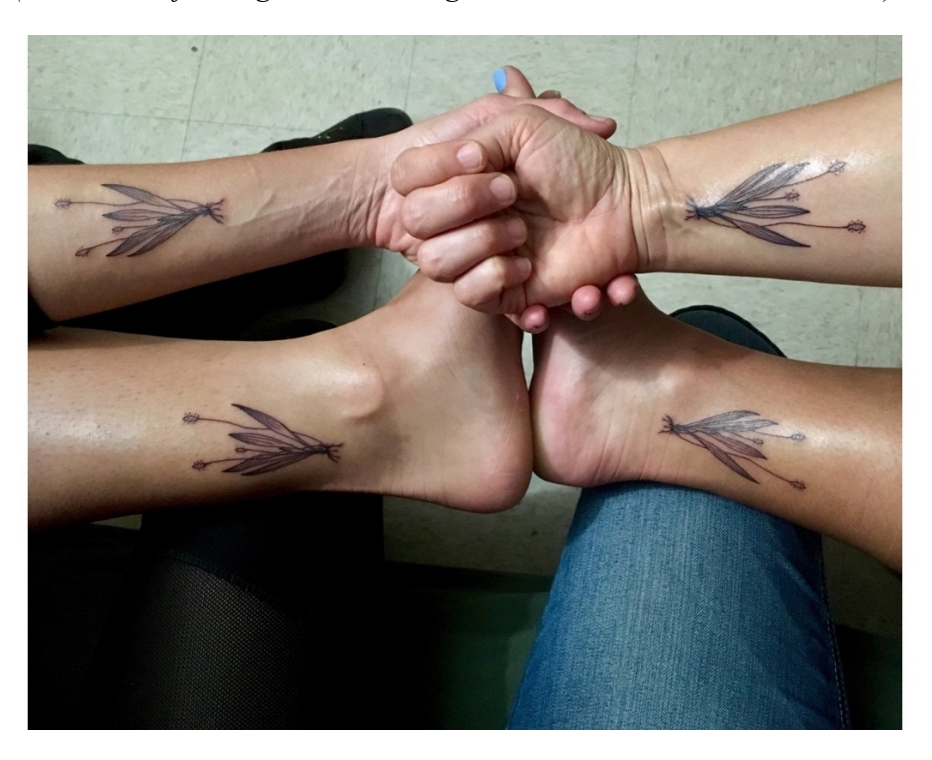
Figure 1. Rebekah and fellow HEAL SoPL members pose with their new tattoos of the plantain plant.

(Rebekah, reflecting on Tierra Negra: HEAL SoPL, December 2018)