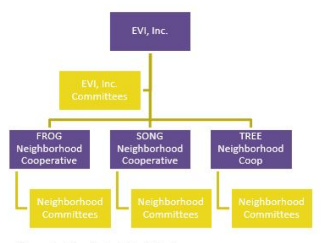
Organizational chart for EVI, Inc.

Rachel Carson Ecovillage (RCEV) will be located at Chatham University's Eden Campus in Gibsonia, PA (20 miles north of Pittsburgh). RCEV is still in the planning phase and yet to break ground, but they are currently expecting to be done with construction in 2022. RCEV has a homeownership model, and will feature 30-35 private units ranging in sizes, as well as a community house. The development of RCEV has been divided into phases with certain expectations set before development moves to the next phase. Those expectations are guided by the gradual recruitment of future ecovillagers and the process of raising money to privately finance construction of RCEV. RCEV has a "sociocracy" governing structure that is based on consensus governing. What RCEV should and will look like is debated openly, and by doing this, all ecovillagers at RCEV arrive at the same conclusion through mutual agreement via the sociocratic process. This sense of empowerment through sociocracy and shared governance is something RCEV tries to sell future ecovillagers on.