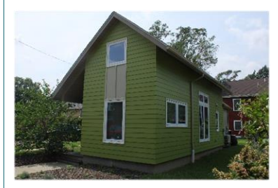
Example of a tiny home at CEV.

CEV was created after community members rallied around the possible loss of a public transit hub and creation of a thruway that would have cut the Detroit-Shoreway neighborhood in half. The CEV ecovillage is somewhat unusual, in that it is dispersed throughout the neighborhood. There are several models for housing in CEV. For example, CEV does lease-purchase housing—after 15 years of leasing, the lessee has the option to buy the home based on equity accrued in lease payments. CEV also features a multi-use apartment complex and townhomes. There's no governing structure that is led by the ecovillagers—operations are managed by Detroit-Shoreway Community Development Organization (DSCDO). DSCDO consults ecovillagers and community members whenever taking on projects and expansions. DSCDO also manages business properties in the Gordon Square Arts District, which is an area of focused economic