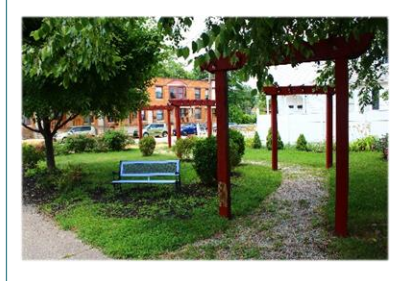
Pocket-park maintained by CEV at Bridge Ave. and W 58<sup>th</sup> St.