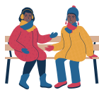
De-escalation & problem-solving